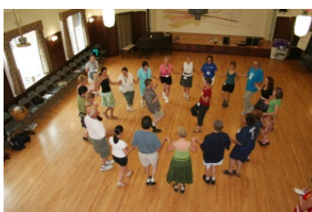
Ethnic Folk Dance Workshops

Become a member of the DCFF Work Scholar Team! Work hard and play hard while you perform a critical role in helping the Festival run smoothly. You'll receive a complimentary weekend pass, reduced lodging costs and other staff discounts. Info: www.dcontrafest.net/workscholar Contact: workscholar@dcff.net