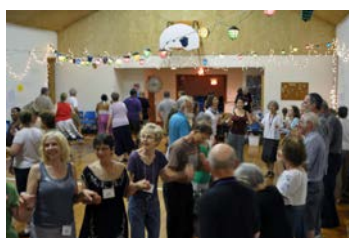
Ethnic Dance Parties