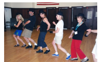
Folk Dance Olympics