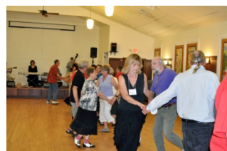
Contrasts & Squares